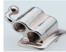
Double Buccal Tube Roth Prescription .018