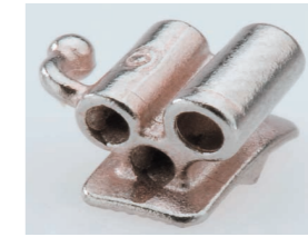
Triple Buccal Tube Roth Prescription .018