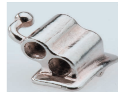
Double Buccal Tube Roth Prescription .022