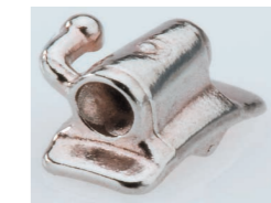
Triple Buccal Tube Roth Prescription .022