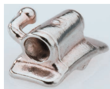
Single Buccal Tube Roth Prescription .018