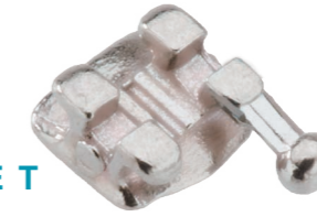
Hilgers & Ricketts Prescription .018